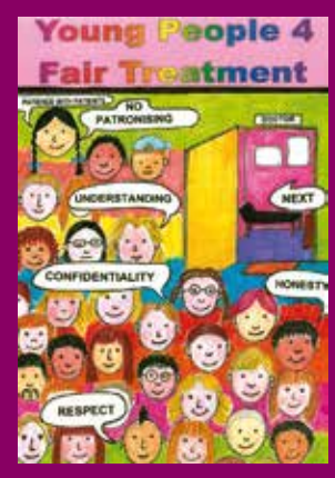
Inderjit Mehroke, England